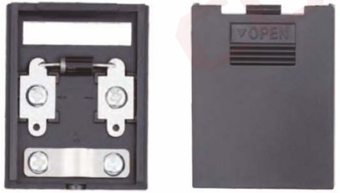
(Series Image-Reference Only)

Plating type 6: Tin Main Body Color B: Black